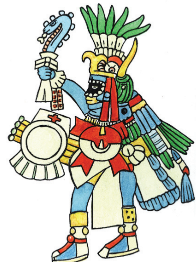
an Aztec god