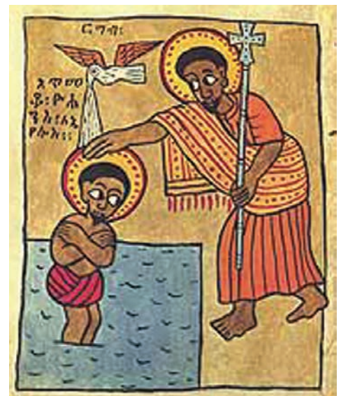
A picture from an Ethiopian Bible